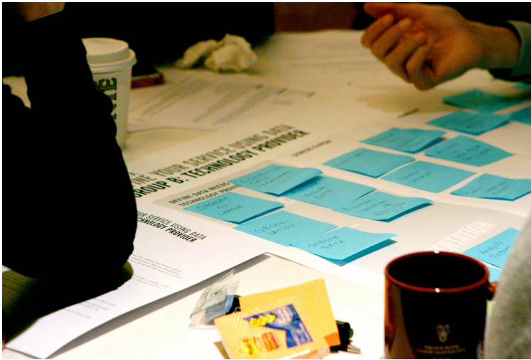
Figure 4 Role-playing at the Global Service Design Network Conference 2011.

Network Conference 2011 (Figure 4). The conference was a key opportunity to road-test our service concept with the input of industry professionals, and role-play was chosen as a tool, as it allowed us to guide workshop participants through our service model, and highlight the potential opportunities of each stake-holder position within the existing stress industry